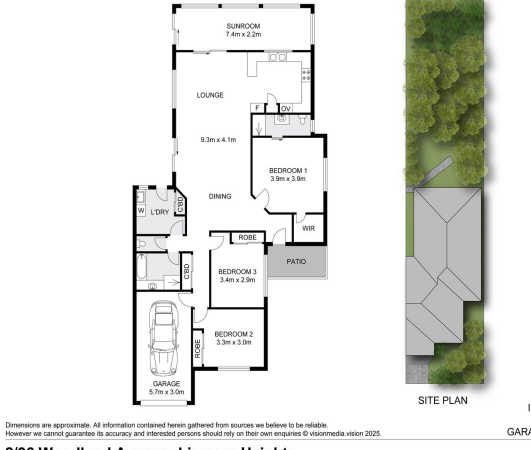
2/36 Woodland Avenue, Lismore Heights